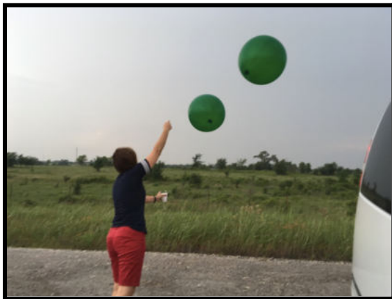
A Swarmsonde is released with two balloons attached to the sonde

When the sonde is released from the ground it is attached to two balloons instead of one. At a user-defined altitude, one balloon is cut off from the sonde. The balloon that still is attached to the sonde has enough helium to keep the sonde at the preferred altitude for a longer time. The sondes use a TDMA radio algorithm to share a single frequency, and data compression to transmit all data over a long-range radio. Swarmsonde is based on the miniature radiosonde Windsound.